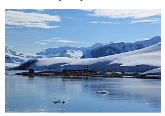
Day 11 – Monday, January 24: